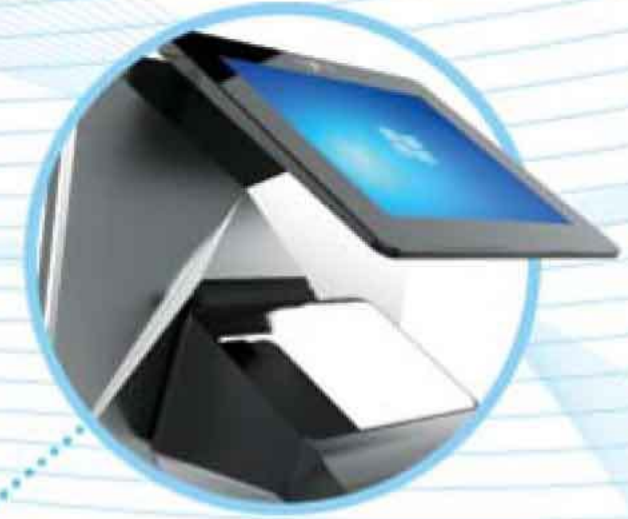
VFD / 10" / 15" Customer Display