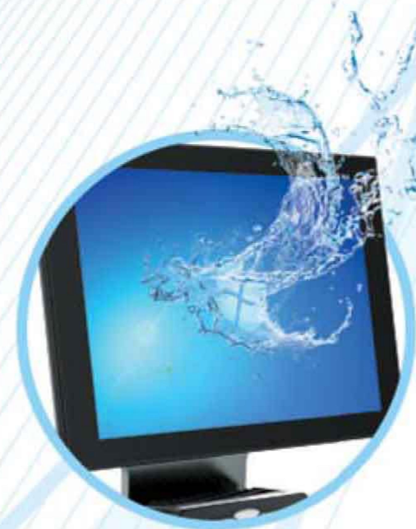
IP54 Whole Unit