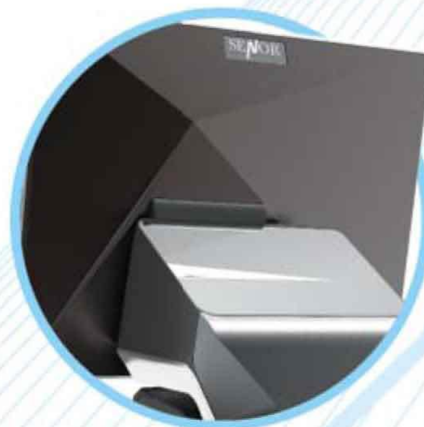
Aluminium Die-cast Sleek Enclosure