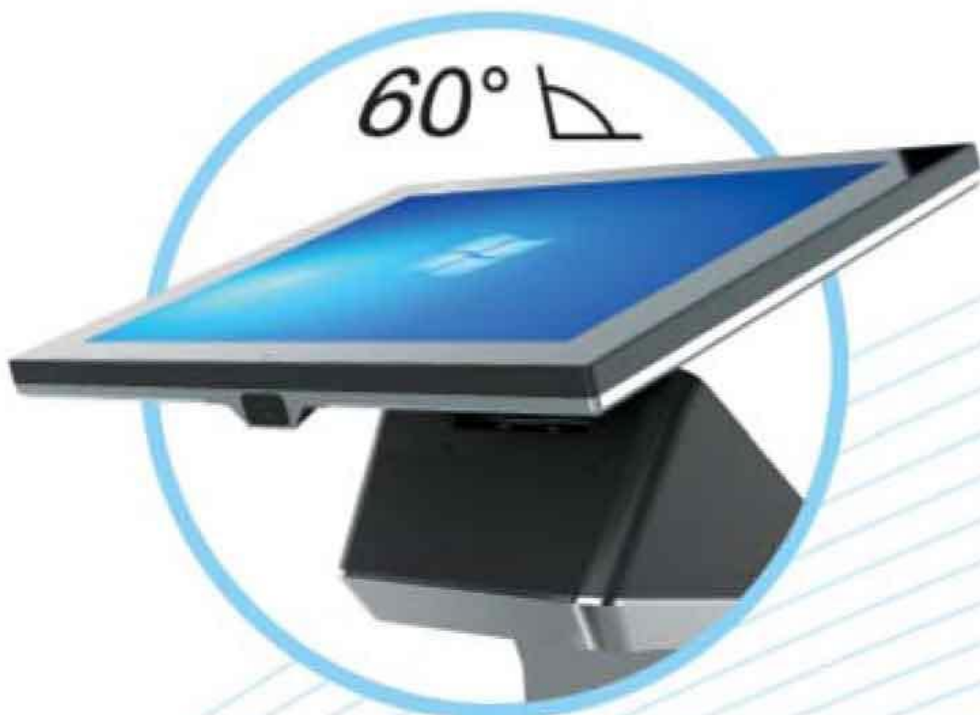
60 Degree Tilt Adjustment