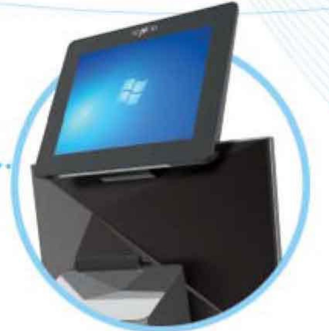
Upward Facing Display