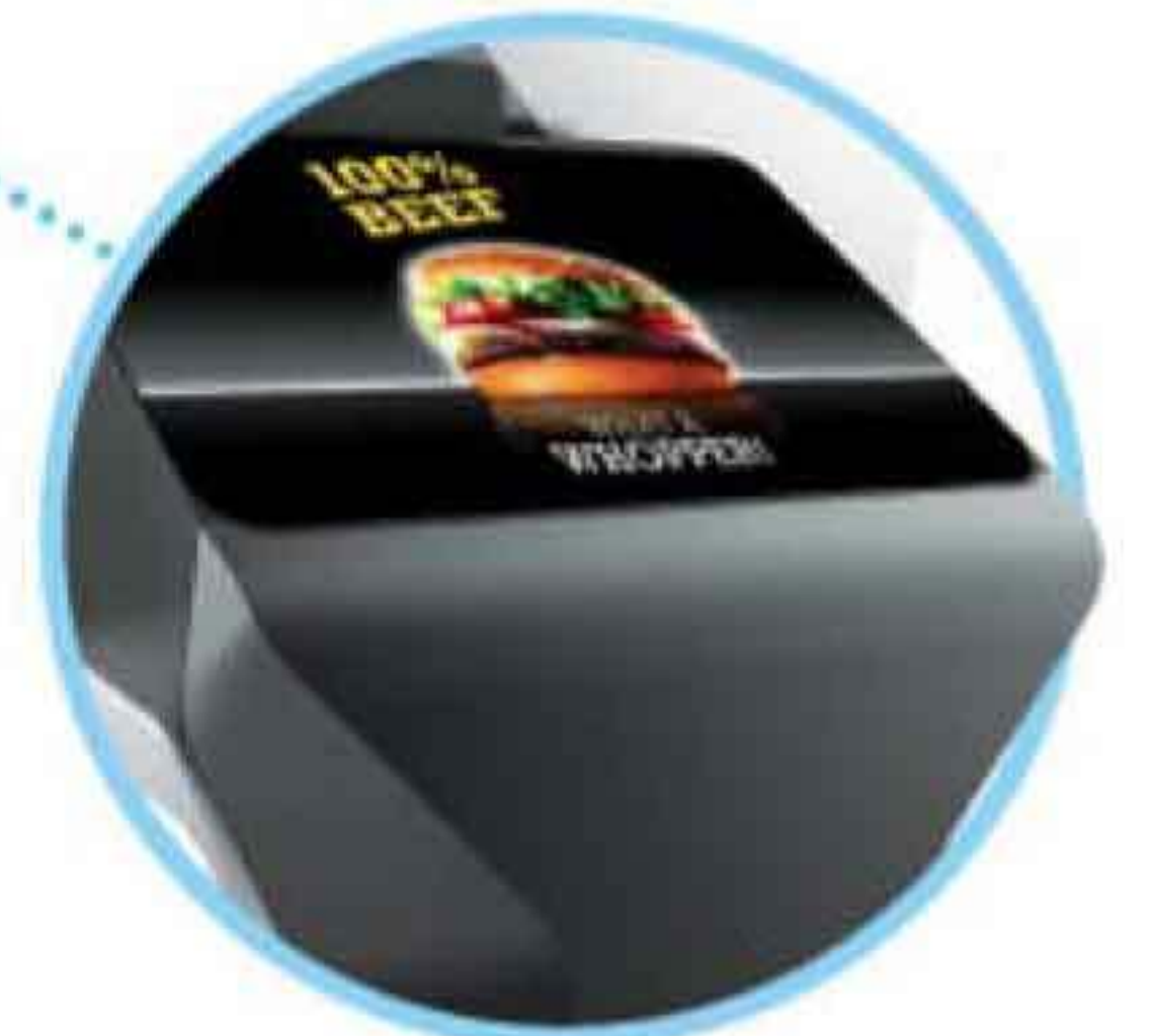
7" LCD / Customised Logo