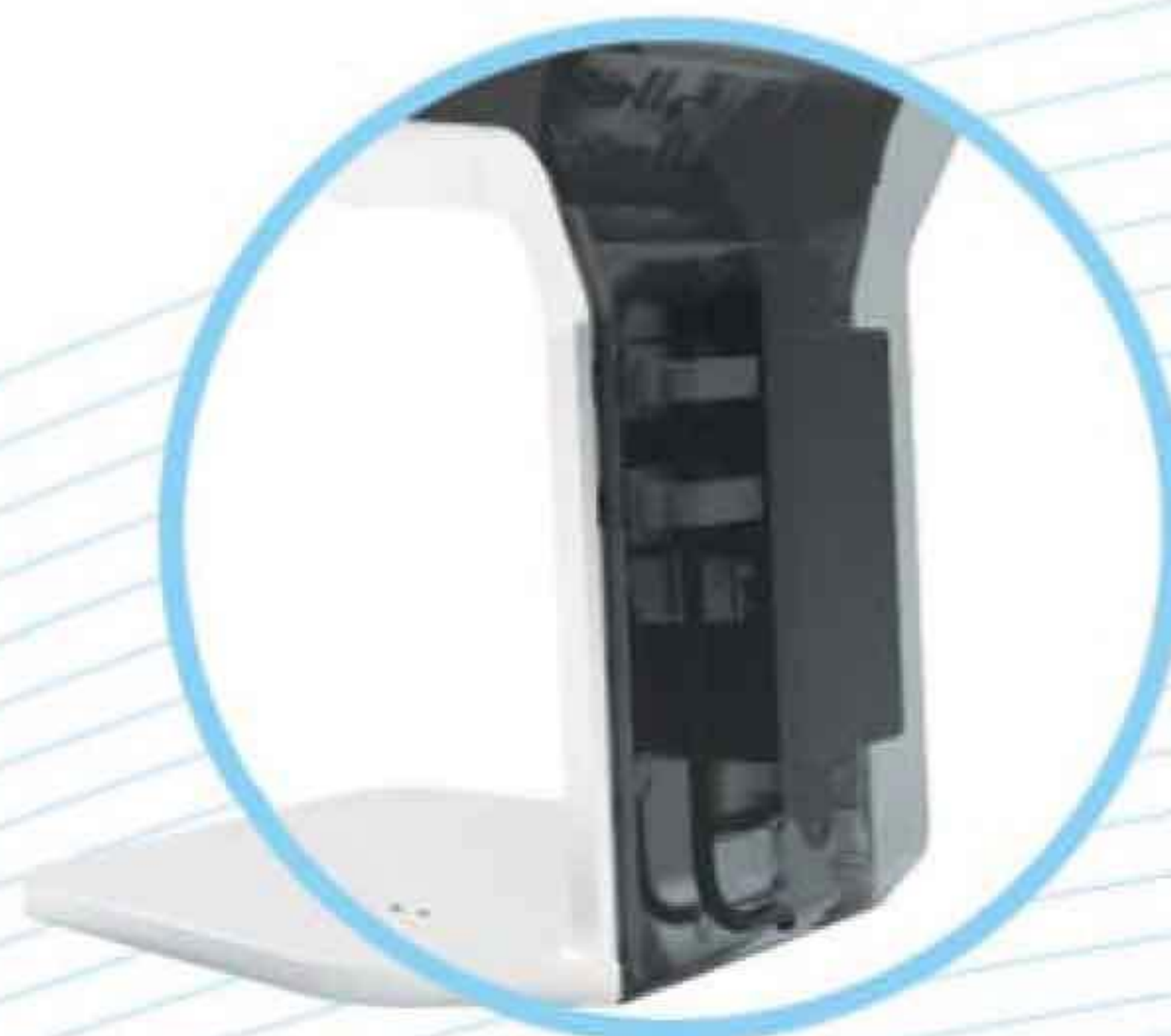
Internal Power Supply Cable Management System