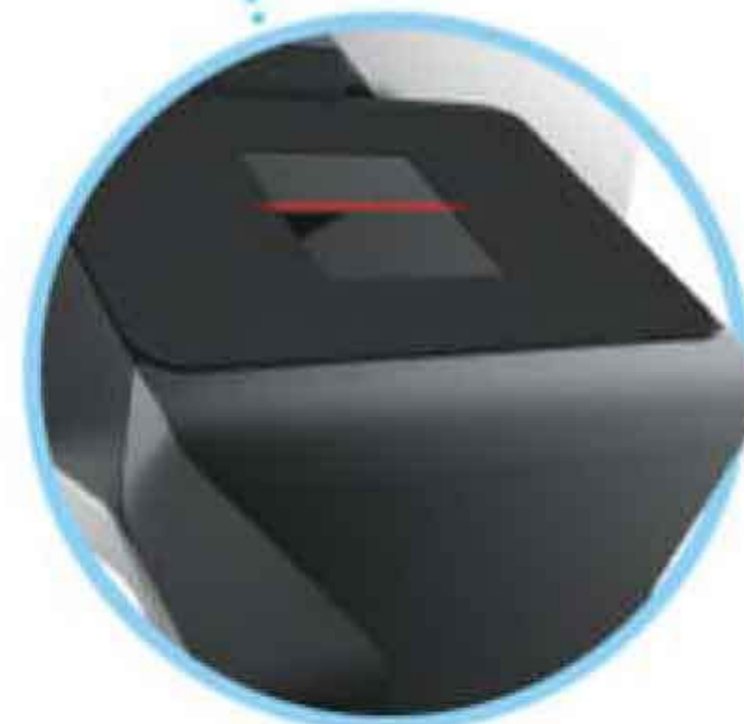
2D Barcode Scanner / RFID (NFC)