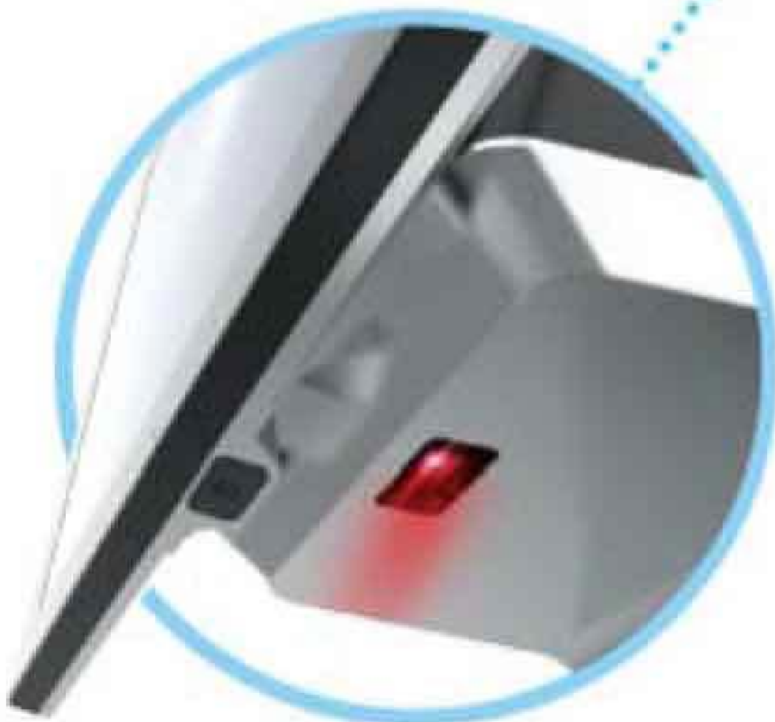
Integrated 1D Barcode Scanner