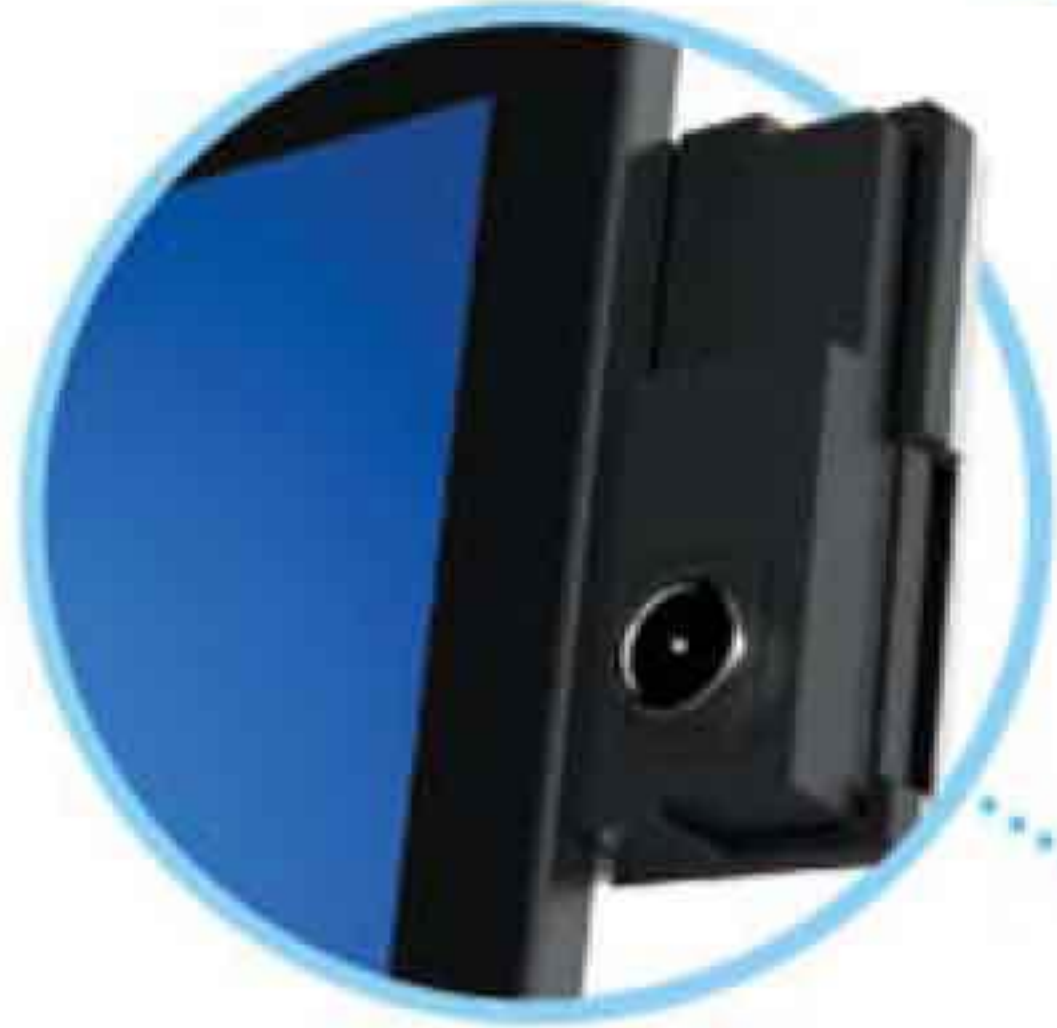
MSR / Fingerprint / RFID Reader