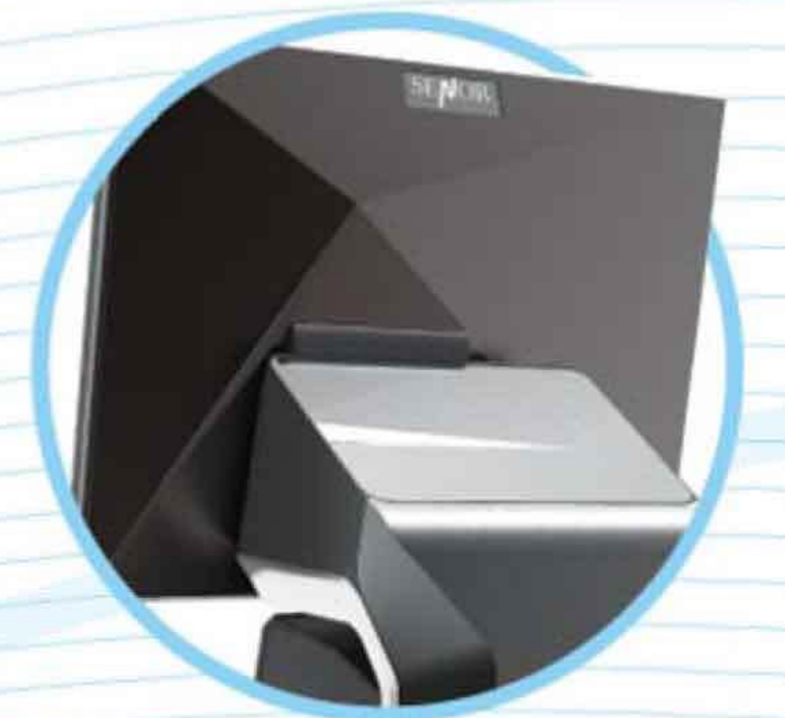
Fanless / Ventless / Screwless